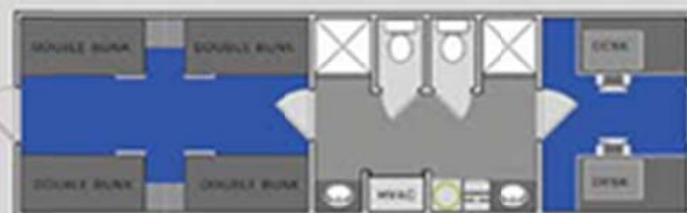
8 MAN LIVING QUARTER WITH DOUBLE OFFICE