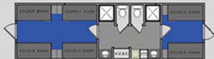
12 MAN LIVING QUARTER